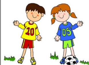
Afterschool Football Fridays from 3:00pm to 4:00pm

It is really important that all children arrive at school on time and that everyone is collected promptly at hometime. Thank you for your support with this matter.