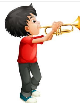
Brass tuition Every Monday