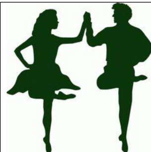
Céilí dancing Mondays at 11:00am