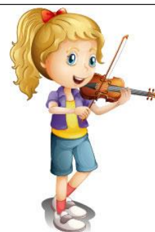
Strings tuition Every Thursday